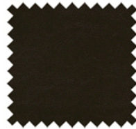
541 D Brown